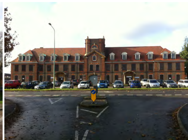
Fig 3. Nurses' Home Building