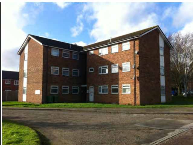
Fig 2. Oakapple House Building